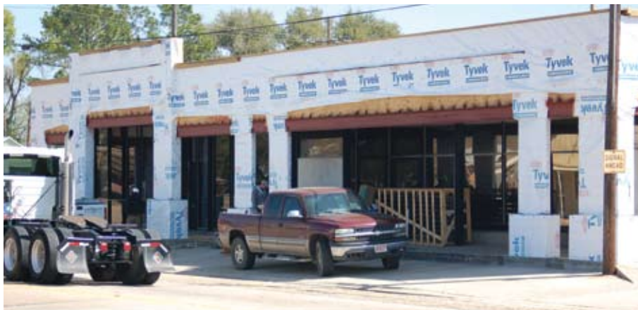
Construction of the new town hall in downtown White Castle is progressing quickly. The mayor’s office and other administrative functions will move into the new facility. This will open up the existing town hall location for use by the White Castle Police Department. This is one of many plans to renovate and develop the downtown area.

The downtown changes include construction of a new town hall, which will be completed in June. The mayor’s office and other administrative offices will move into the new town hall, leaving room for the police department to move its operations to the existing location. These changes are part of the plan Williams calls “Future WC,” and he says most of the elements of the plan will be complete by the summer.