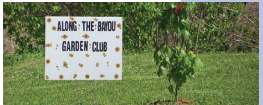
The first group activity of the newly formed Along the Bayou Garden Club was to plant Cypress Tree Saplings, Swamp Maples and Swamp Magnolias at the Grosse Tete Boat Launch at Grosse Tete. Many more activities like this one are scheduled as the club sets up its calendar of activities for the upcoming year.

In addition to current activities, the Along the Bayou Garden club plans to promote activities to introduce young people to gardening and stress the importance of keeping neighborhoods clean. The garden club also plans to work with clubs such as 4-H in the near future.