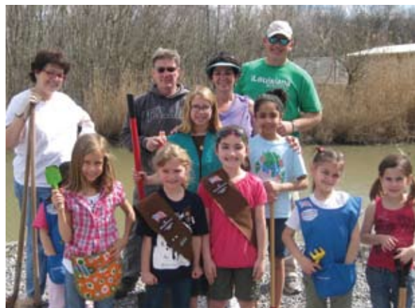
TREES ADD BEAUTY TO PARISH... Keep Iberville Beautiful, the Plaquemine Garden Club, Along the Banks Garden Club, the Iberville Parish Council, DEQ, Apache Oil Corp., and local Brownie scouts teamed up on Feb. 19 and 26 to enhance the natural beauty of parish by planting native trees at boat landings. Shown at left are some of the volunteers.