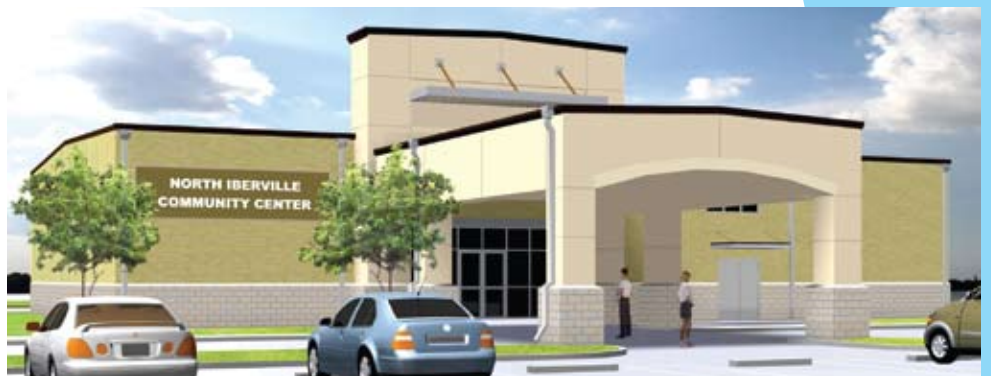
COMMUNITY CENTER CONSTRUCTION BEGINS... Construction of the North Iberville Community Center was expected to begin in March, with completion set by the end of the year. The $2.6 million facility will be constructed by Bryan Bush Construction of Baton Rouge. The facility will include 8,500 square feet of space and a concrete parking area. Above is a rendering of the completed facility, which was designed by Fusion Architecture.

Ochsner Health System, in addition to its Medical Center locations in Baton Rouge, owns and operates 7 acute care hospitals and provides physician, specialty and outpatient care at over 50 locations in Louisiana. Ochsner’s Baton Rouge services include six local health centers and Ochsner Medical Center – Baton Rouge, a full service acute care hospital located at I-12 and O’Neal Lane.