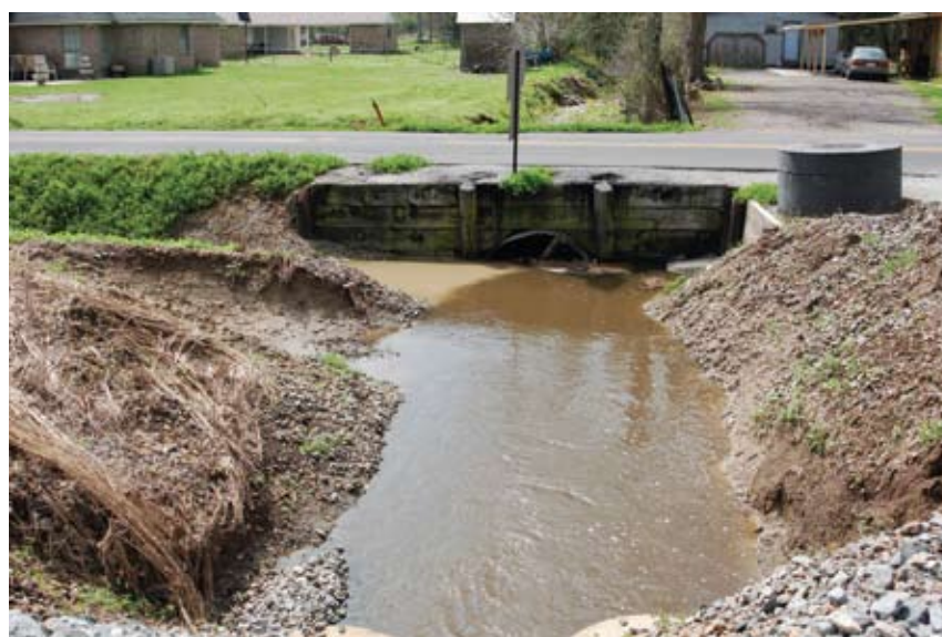
The new design of the Church Street drainage canal is expected to keep debris from blocking the flow of water and minimize street flooding in the area. The project is underway and will be complete by late spring.

“This improvement project should result in better storm water drainage for the areas upstream of the canal,