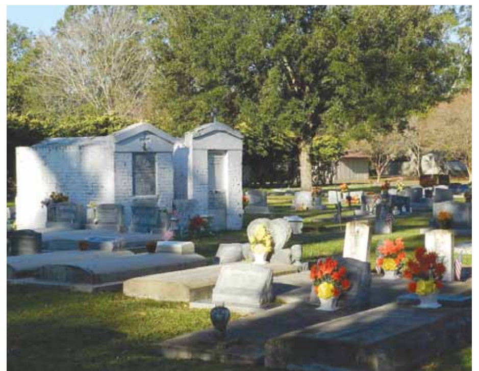
The tomb of the Erwin family (to the left) is located in the historic Rosedale Cemetery, which is slated for improvements that include lighting, sidewalks and the placement of an American flag.

Chumba estimates that phase of the project will be accomplished by April, and construction will be completed by next December.