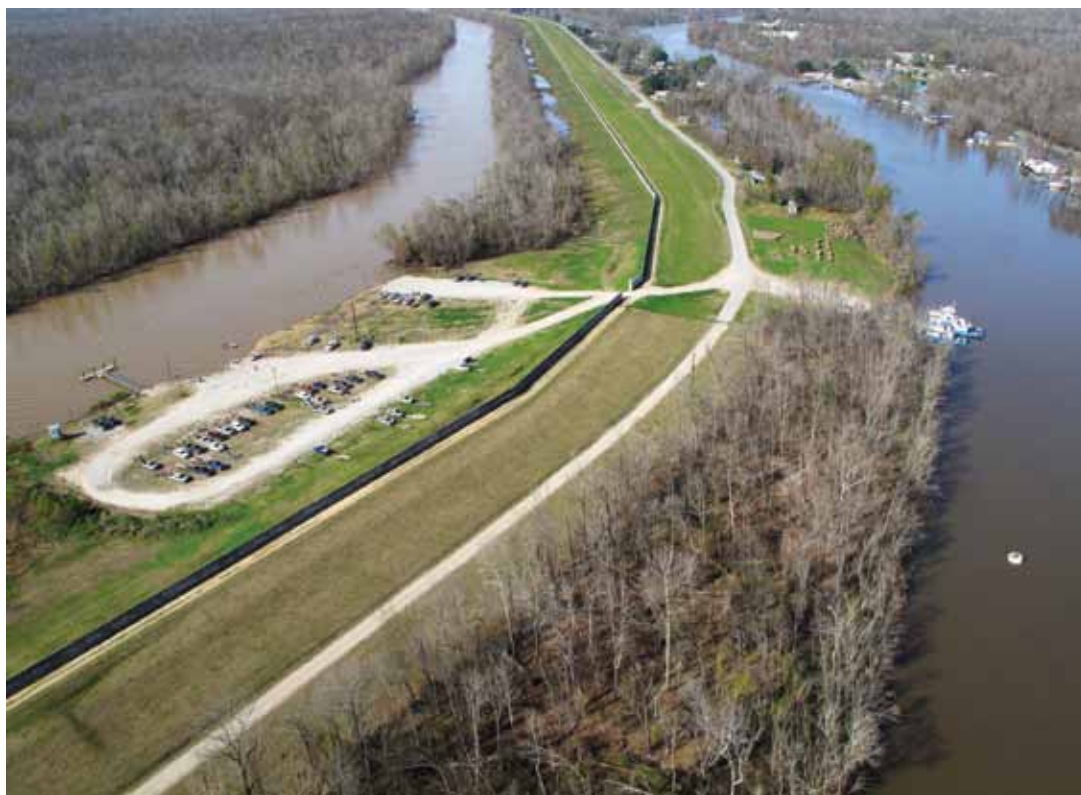
BIG IMPROVEMENTS COMING... Shown is an aerial view of the Bayou Sorrel boat landing during the flooding of 2009. The waterway at left is the Atchafalaya Basin and the waterway at right is Grand River. The housing around Grand River is a portion of the Bayou Sorrel community. The 2012 improvements to the boat landing will make it the best boat landing in the parish.