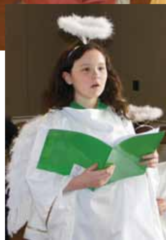
CELEBRATING CHRISTMAS... Above and at left are scenes from the annual Children's Christmas Festival and Parade, sponsored by the Plaquemine Main Street Program and We Are The Difference, Inc. It was held on Dec. 3 at the new pavilion at Bayou Plaquemine Waterfront Park, and featured a visit by Santa Claus and a variety of children's activities.