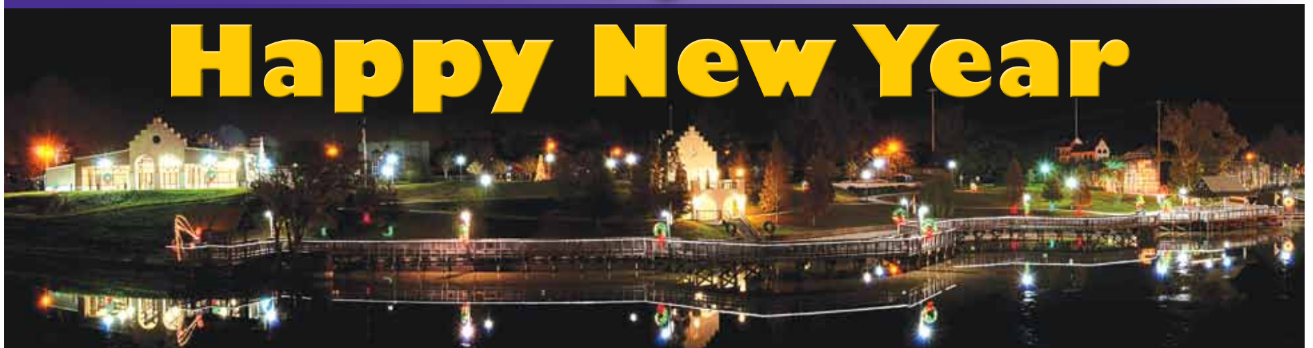
The Bayou Plaquemine Waterfront Park, with its beautiful new pavilion at far left, is lit up for the holidays.