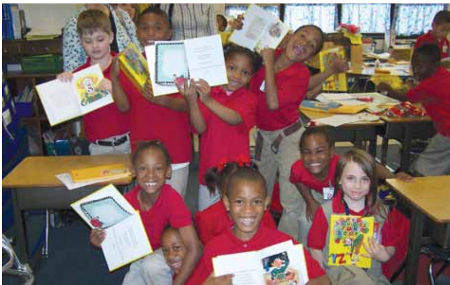
CHARACTER BOOKS... Kindergarten and first grade students love receiving their Character Books because the books include the students' names. The books are designed to promote reading and are given annually by East Iberville-INC.