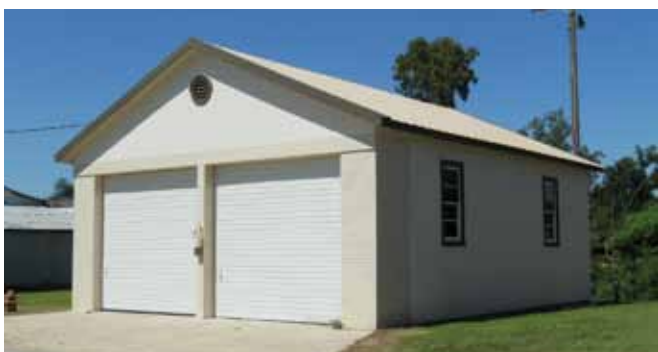
The old firehouse, built in the late 1950s, has been repaired and will soon become a museum housing fire memorabilia and village archives.