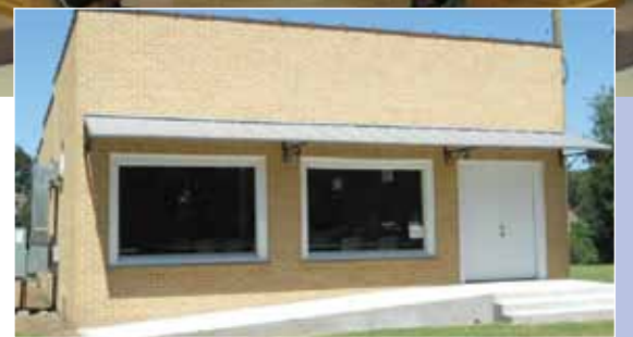
Renovations at a former grocery store, located on Hwy. 77, are now complete and the building is ready for use as Rosedale's Community Center.

a facelift, with a freshly painted council chamber and a new dais where council members will conduct meetings. An unused jail cell has been converted to an office for Rosedale's police chief.