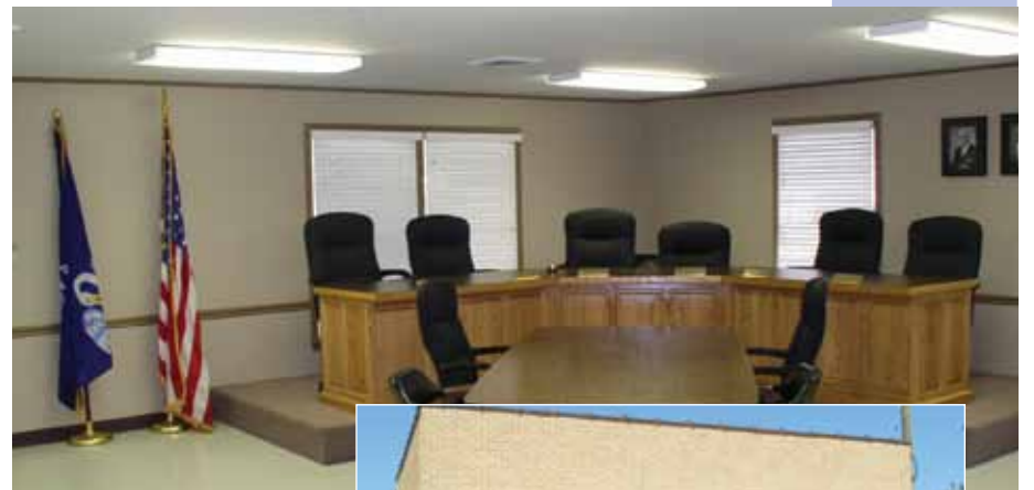
The Village of Rosedale's Council Chamber was recently updated with a fresh coat of paint and a new dais where councilmen can conduct their business.